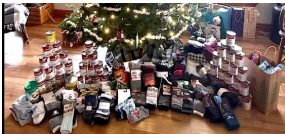
Soup & Socks fundraiser for the Antigonish Food Bank