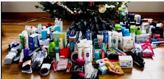
Soap & Socks fundraiser for the local Women's Center