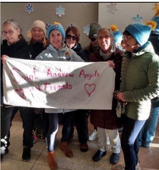
Coldest night of the year Walk for the Naomi Society